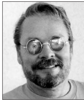
Lightening the atmosphere at staff meeting.