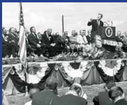
The National Archives