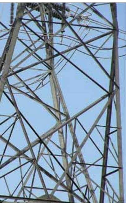
500KV tower to get into working position.